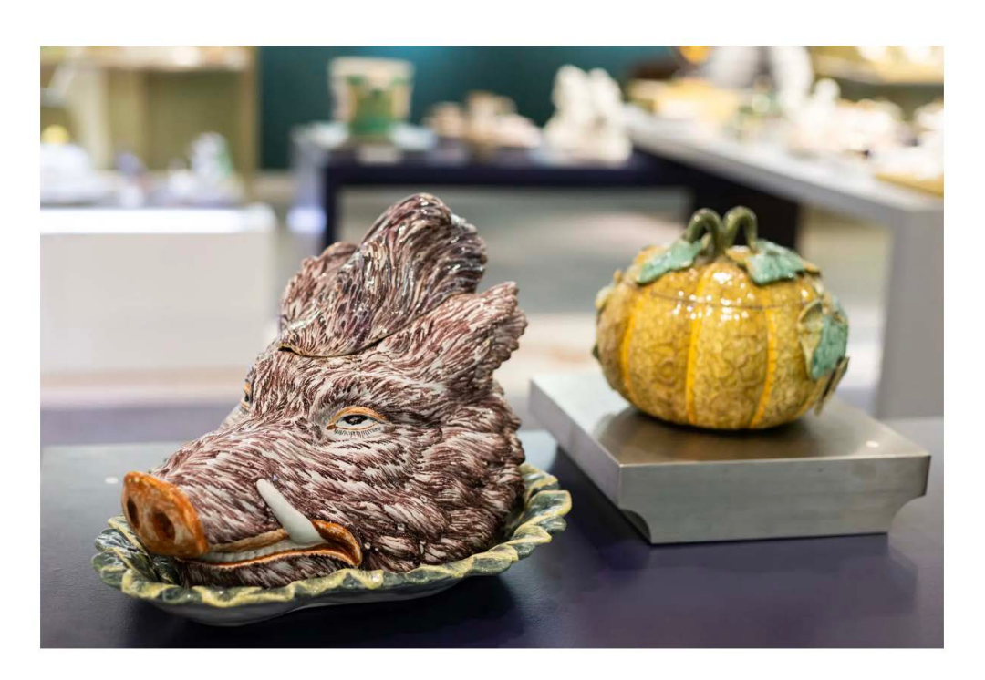
Left to right, faience boar's head terrine (1750-60) and Brussels gourd tureen (1750-60) at Michele Beiny.

7. To serve wild boar in style in 18th-century Holland, you would have needed a stunning faience boar's head terrine (Michele Beiny, 5-15) like this one, with delicately painted tufts of purplish-black fur, resigned eyes, and a cranium that lifts off when it's dinner time.