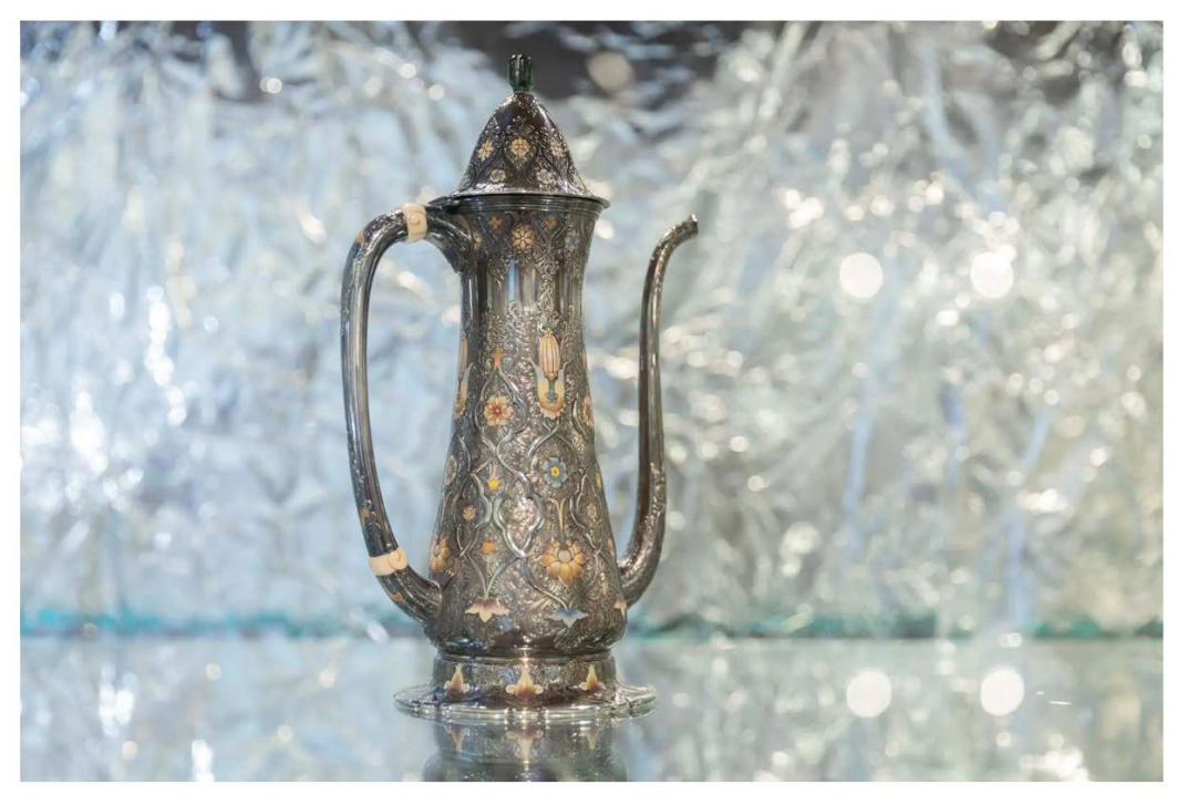
Silver and enamel coffee pot by Tiffany & Co. (1893), S.J. Shrubsole gallery.